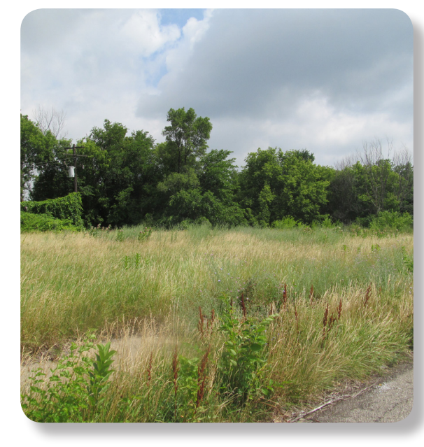
McDougall-Hunt Pilot Project, looking northeast from Hendricks Street